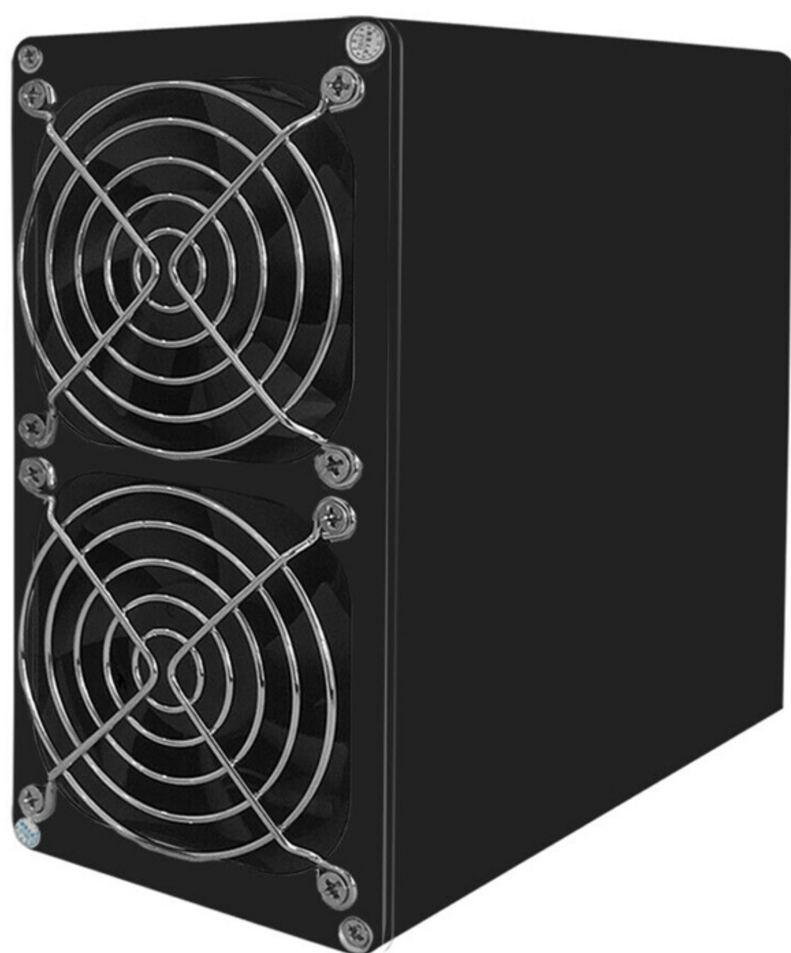
DORPOWER GOLDSHELL KD BOX PRO 2.6GH/S