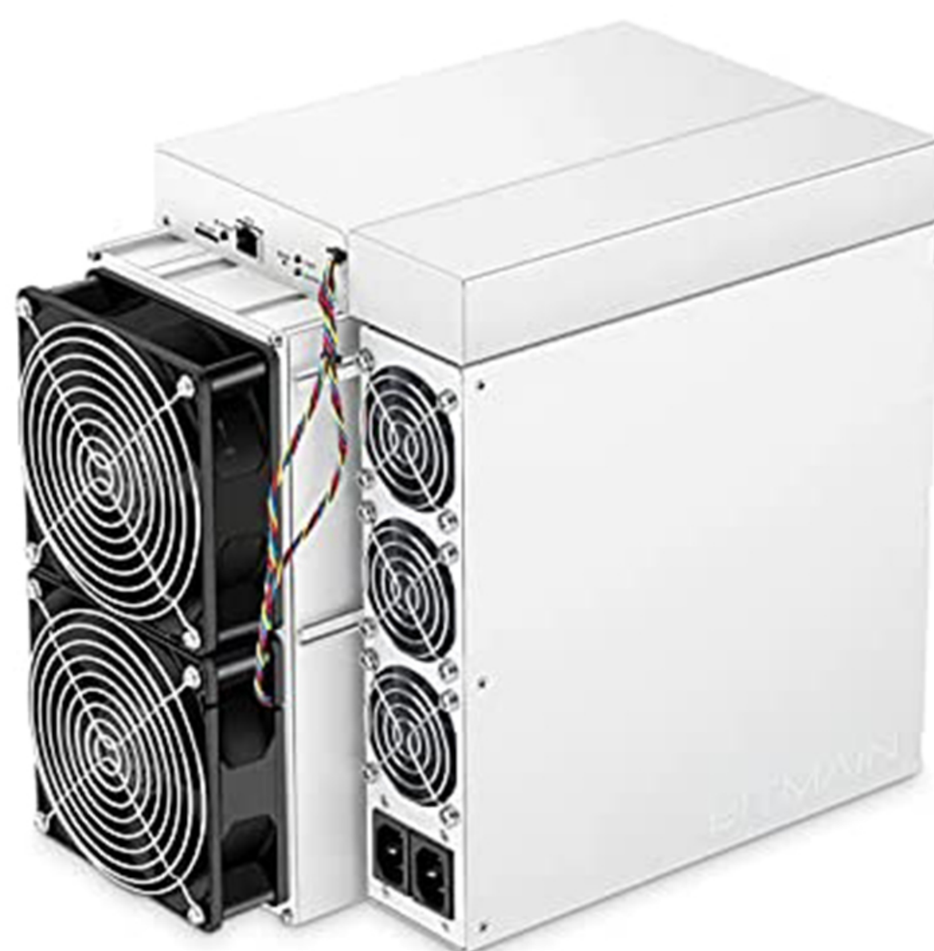
ANKII BITCOIN MINER SUPPLIER, NEW ASIC BITCOIN ANTMINER S19 PRO 110THS 3250W